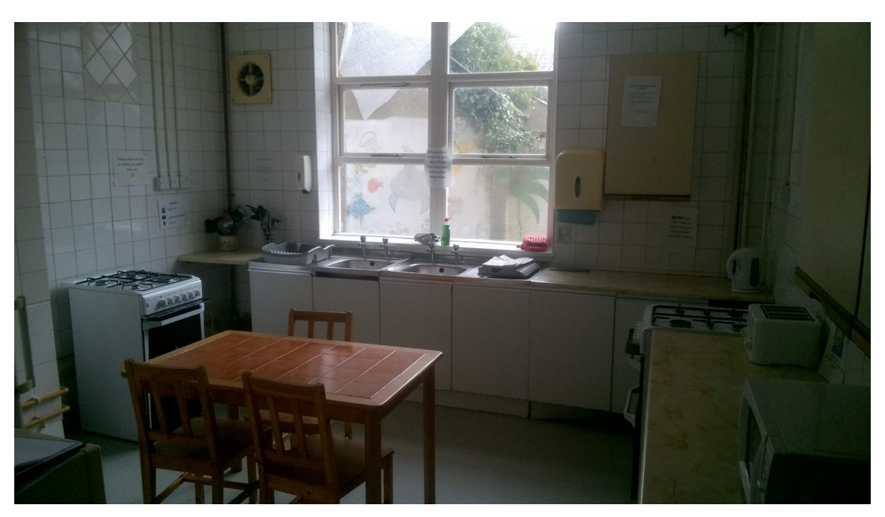
Kitchen (main building)