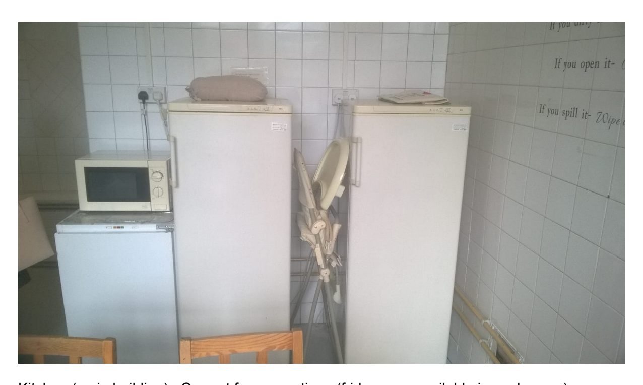
Kitchen (main building). Current freezer options (fridges are available in each room)