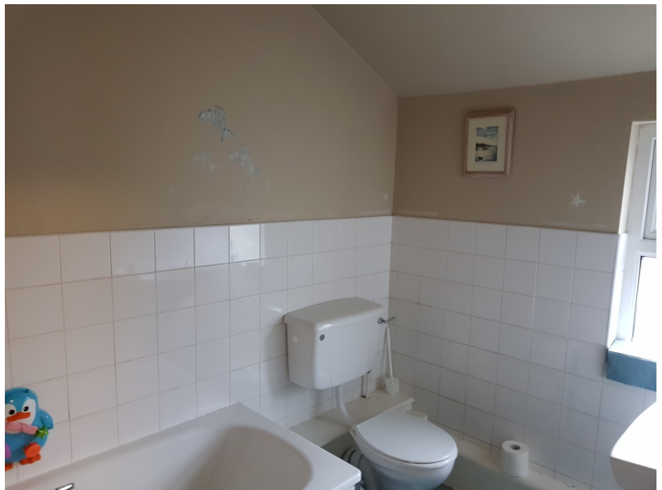
Bathroom - Annexe