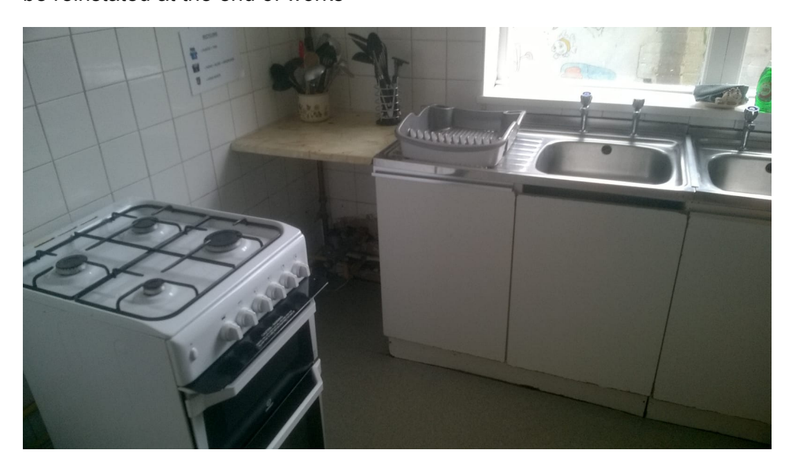
Kitchen (main building)