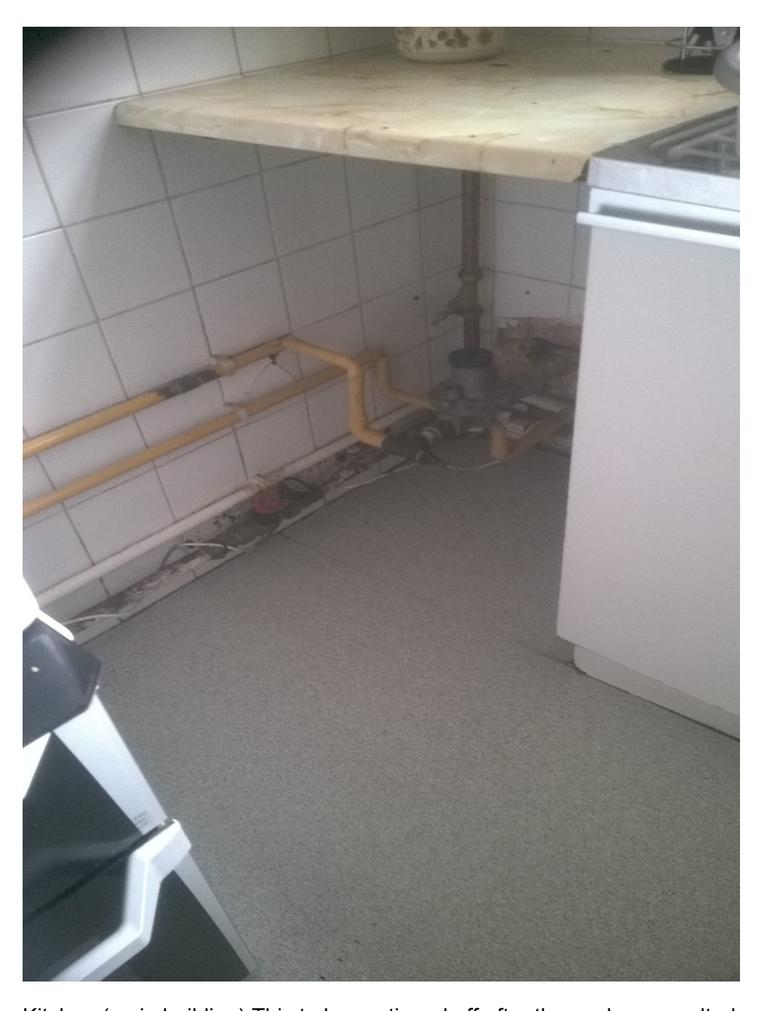
Kitchen (main building) This to be sectioned off after the works compelted