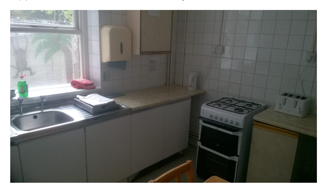
Kitchen facilities in main building. This is the focus of current building work and will be reinstated at the end of works