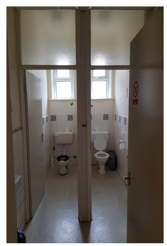
Shared Toilets – Ground floor main building