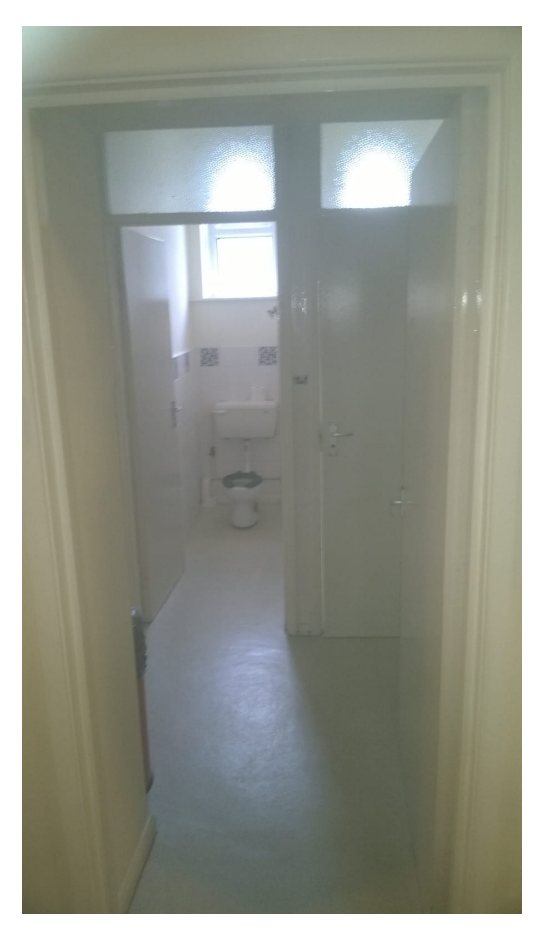
Shared washing Facilities (main building)