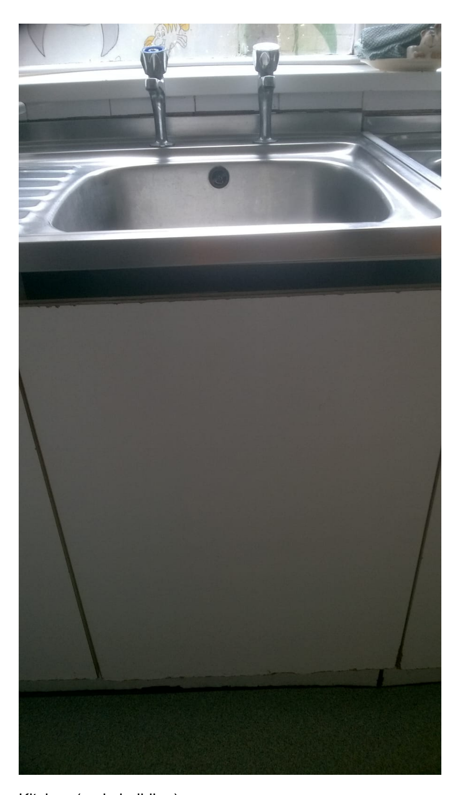
Kitchen (main building)