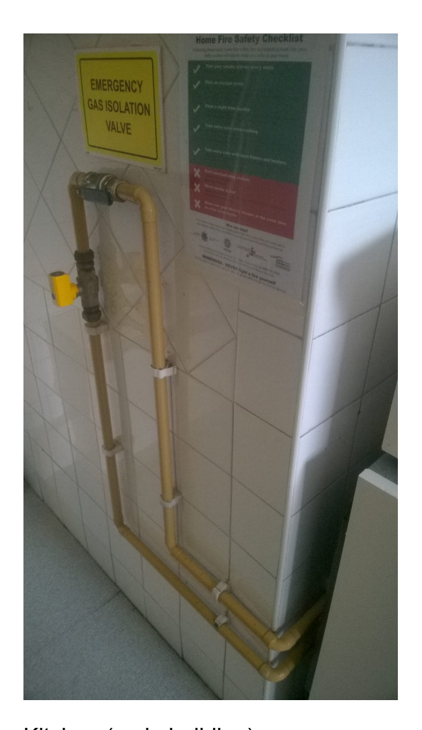
Kitchen (main building)